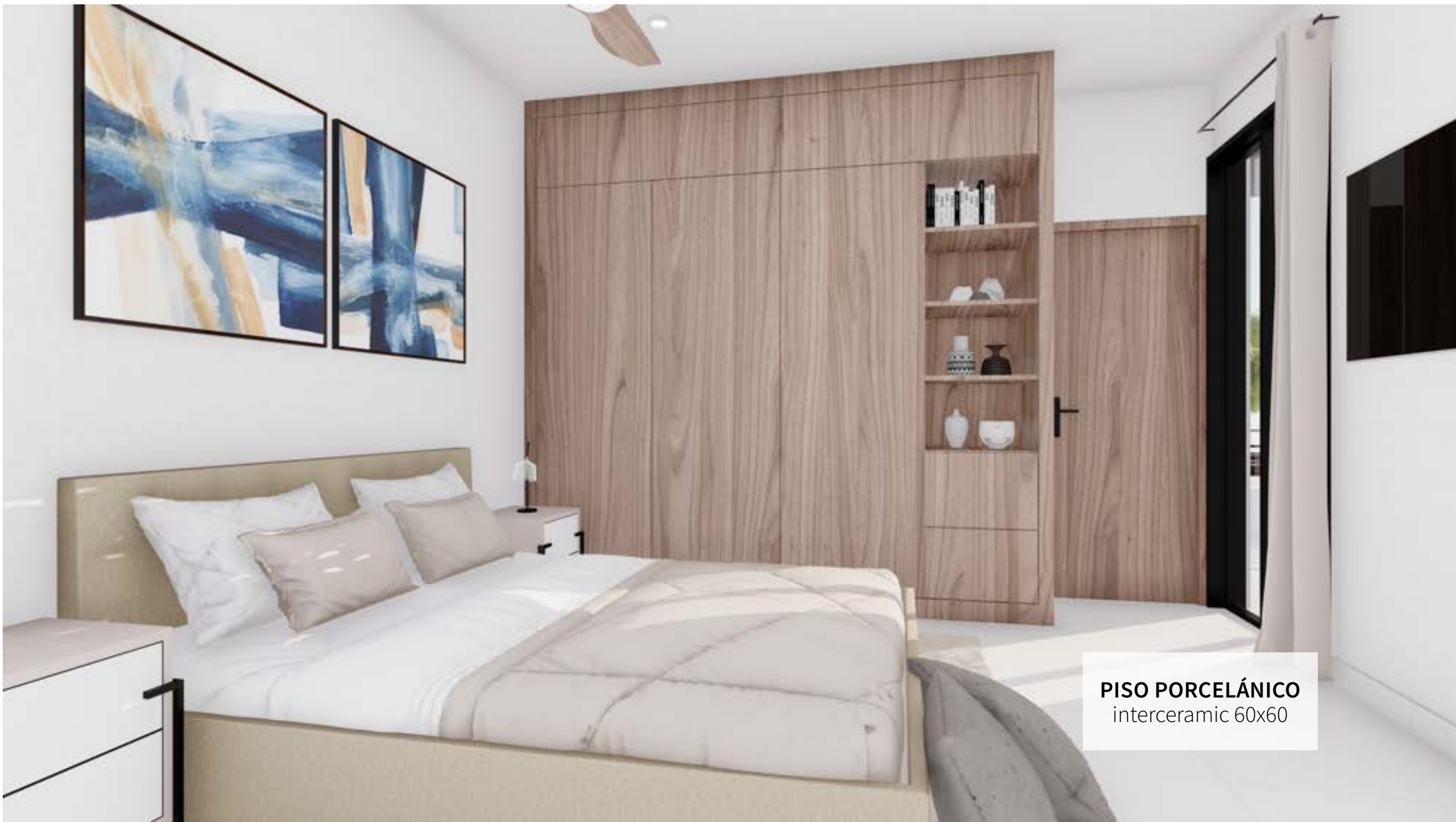
PISO PORCELÁNICO interceramic 60x60